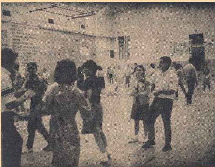
Swing your partner, promenade around the ring . . . "Square dancing isn't for squares."